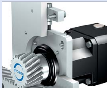
Setting plate (adjustment path > tooth height) for P and PE gear units with optional adjustment device, pinion in mounting position E