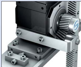
Setting plate for K and KL gear units with adjustment device (front) and lubricating pinion with bracket, pinion in mounting position S