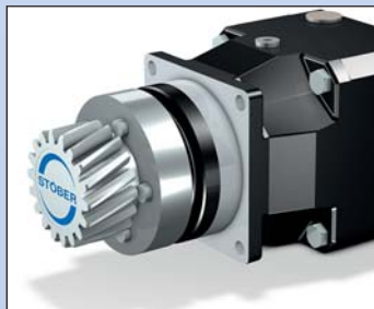
Pinion attached by clamping set

For the gear unit models P5, P7, PE5, K2, K3 and K4, it is possible to attach the pinion with a clamping set.