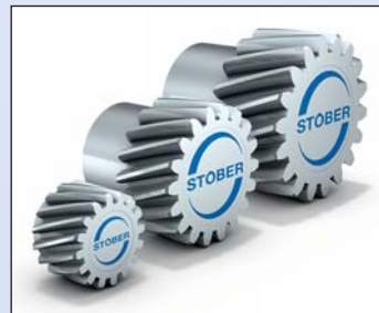
Helical pinions m2/3/4