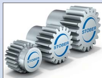
Spur pinions m2/3/4 Small pinion on left mounting position S