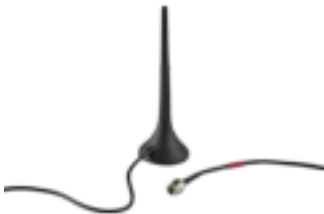
RF magnet antenna 868 MHz