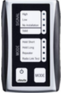
Field strength indicator EPM 300