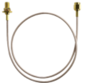
RF SMA antenna socket