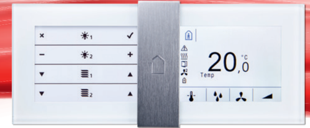
thanos LQ white