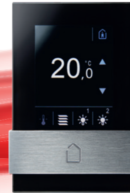
thanos S black