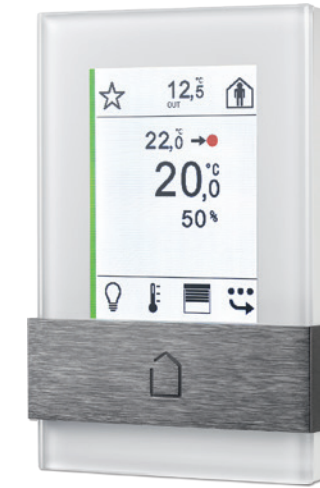
Multiple menus for different applications and scenes