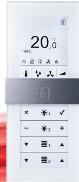
thanos L white